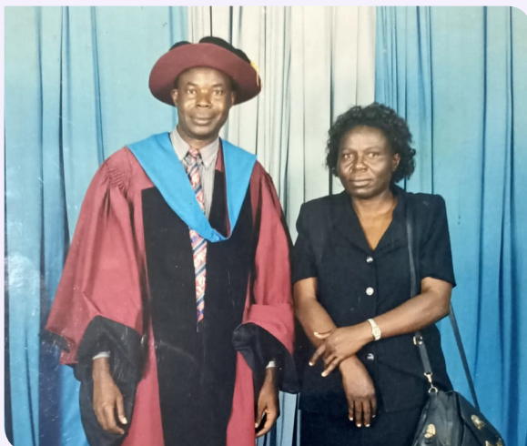
Wedding and special family times