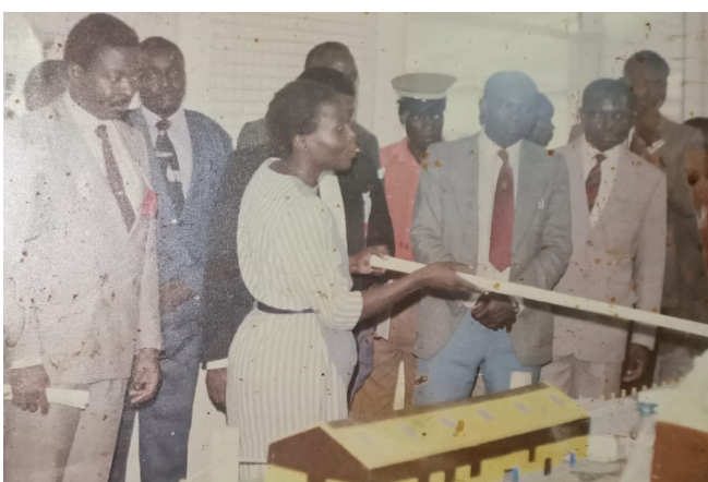
Mom at work with officials from Government