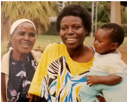
Mom with a niece