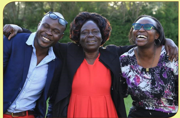
Precious moments with mom