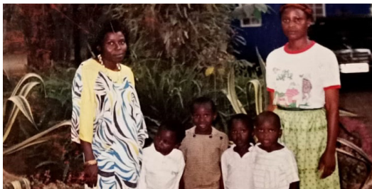
Another family moment