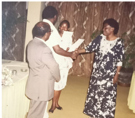
With fellow Managers at Nzoia Sugar Co.