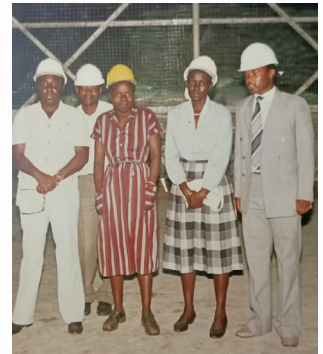
Mom with colleagues at work