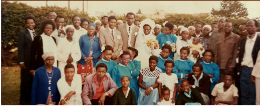
At their wedding