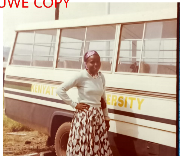
As a young student as Kenyatta University