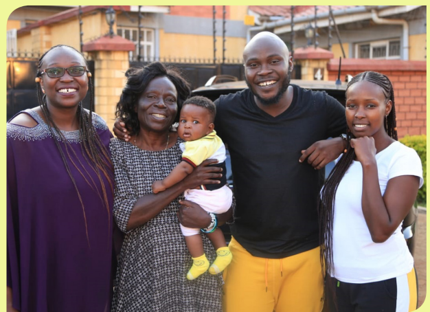
With her children and grandchild