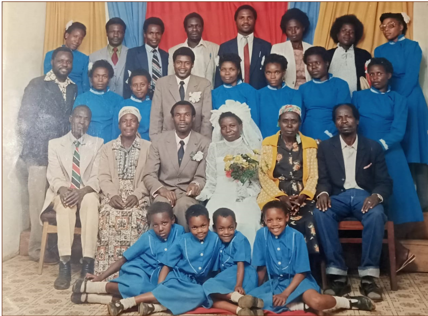
At their wedding