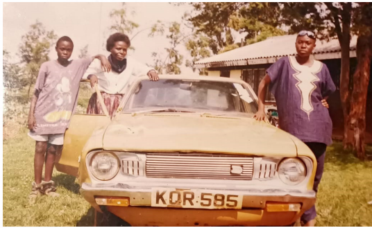
Respect to the first family car