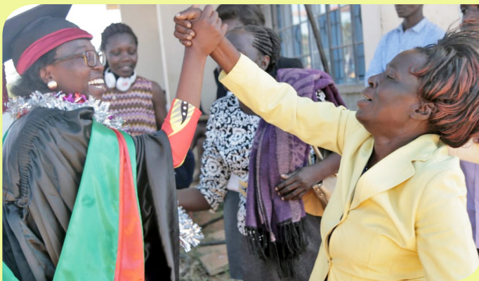
Precious moments with mom