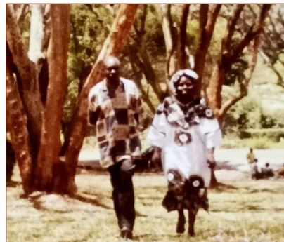
During a visiting day at Kenya high School