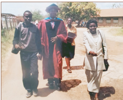
With her husband, son and daughter during his graduation