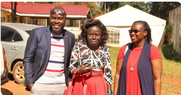
With her children