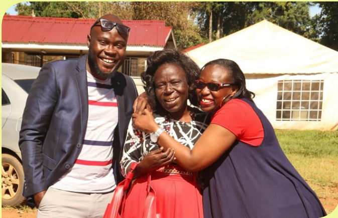
Precious moments with mom