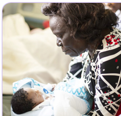
The joy of a grandchild