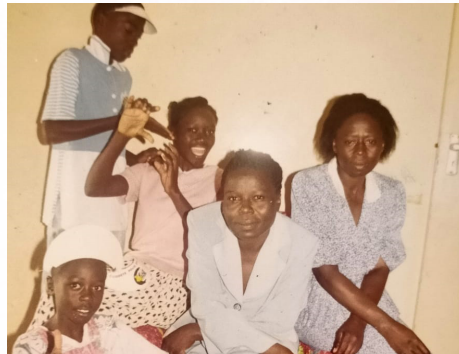
Moments with family members