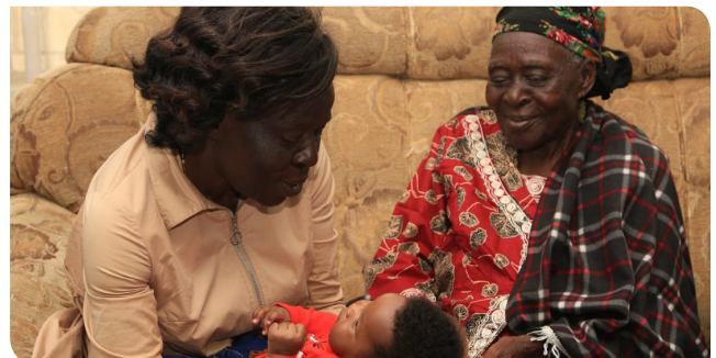
Three generations - with her late mom and grandchild