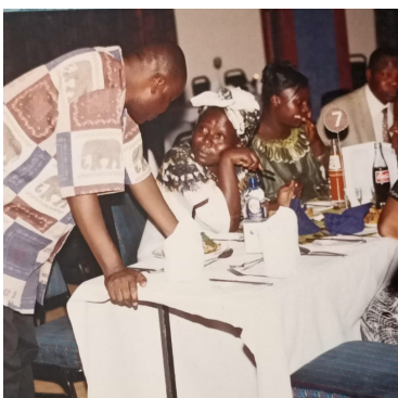
At a parents meeting consulting