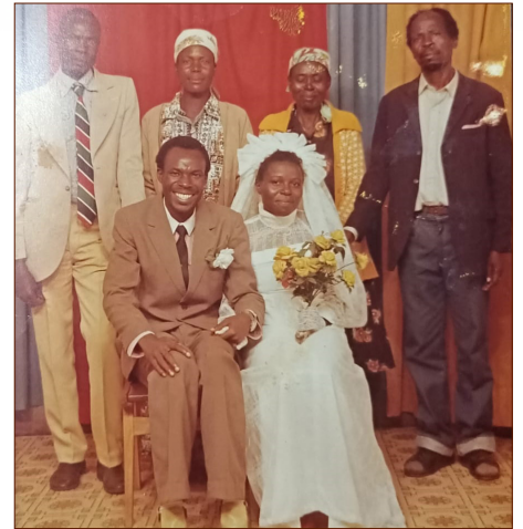
At their wedding