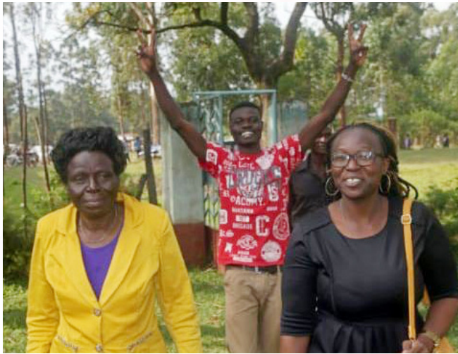
As a young student at Kenyatta University