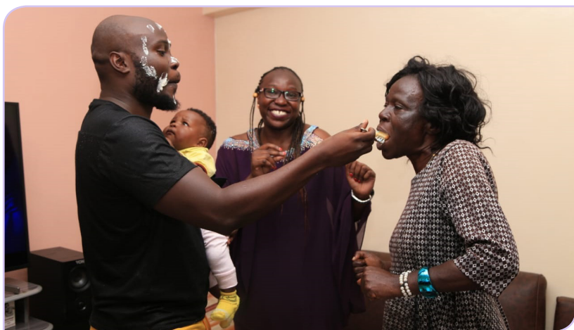
Precious moments with mom