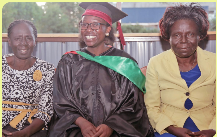
During my graduation