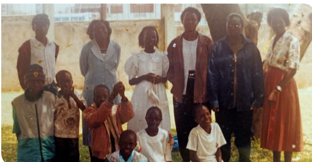
Special family times