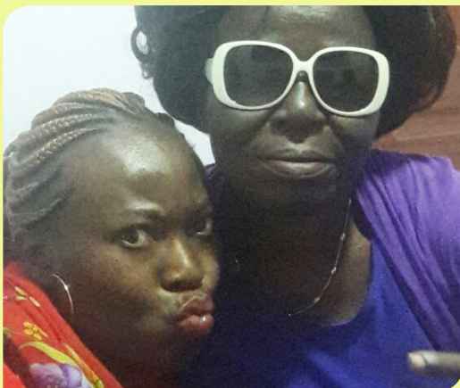
Precious moments with mom