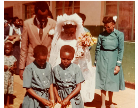
At their wedding